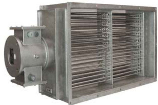
Air duct heater